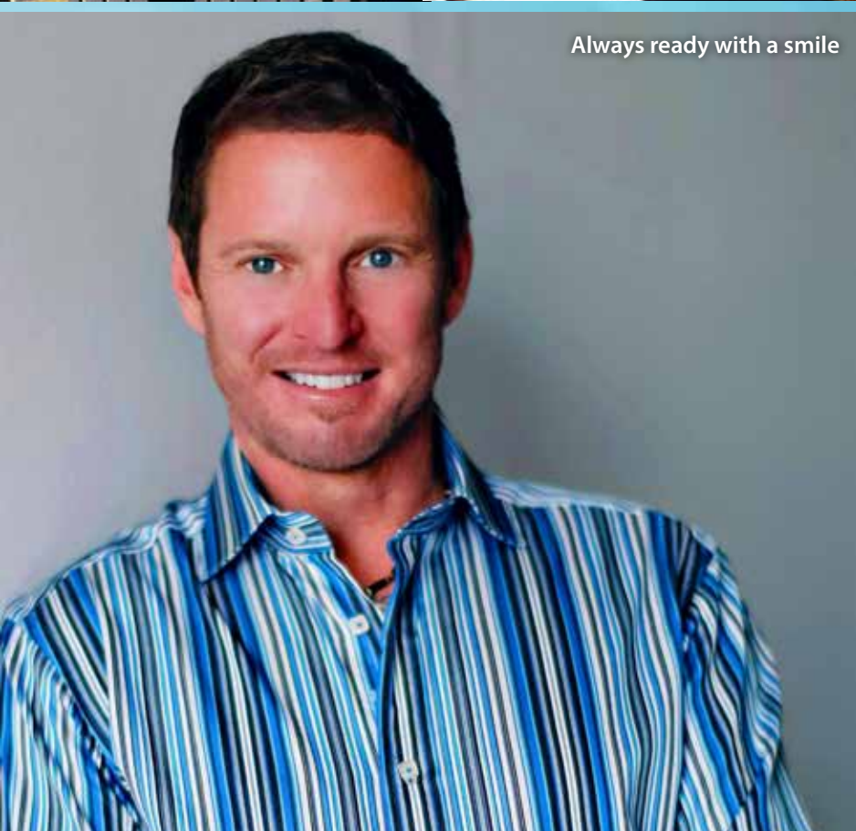
Always ready with a smile