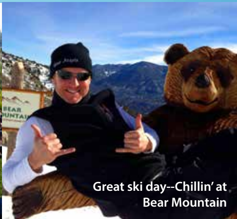
Great ski day--Chillin' at Bear Mountain