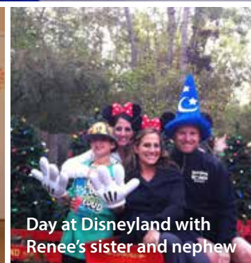
Day at Disneyland with Renee's sister and nephew