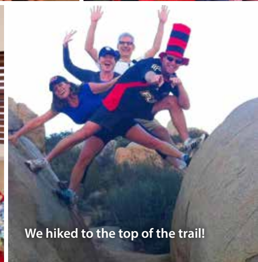
We hiked to the top of the trail!