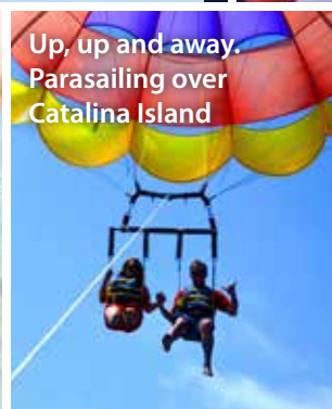
Up, up and away. Parasailing over Catalina Island