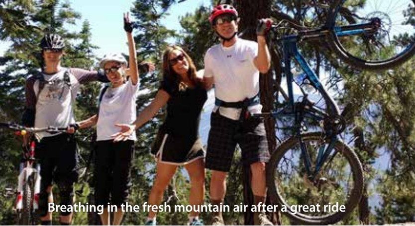
Breathing in the fresh mountain air after a great ride