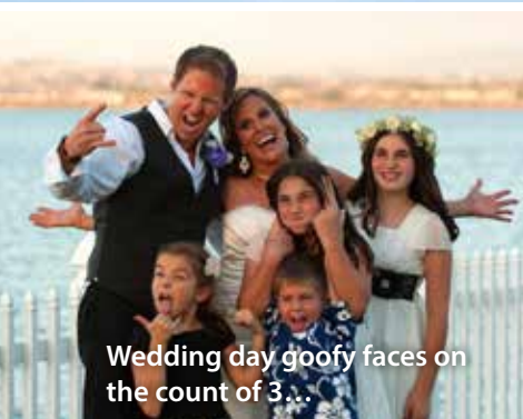
Wedding day goofy faces on the count of 3...