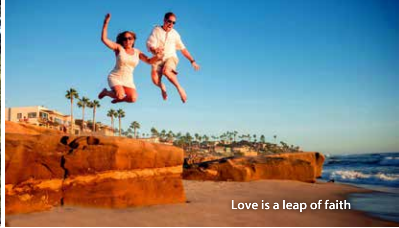
Love is a leap of faith