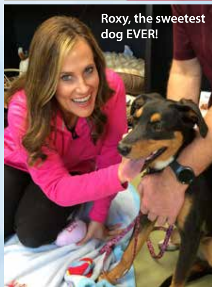
Roxy, the sweetest dog EVER!

"A child will be so lucky to have her unconditional love."