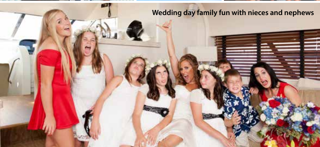
Wedding day family fun with nieces and nephews