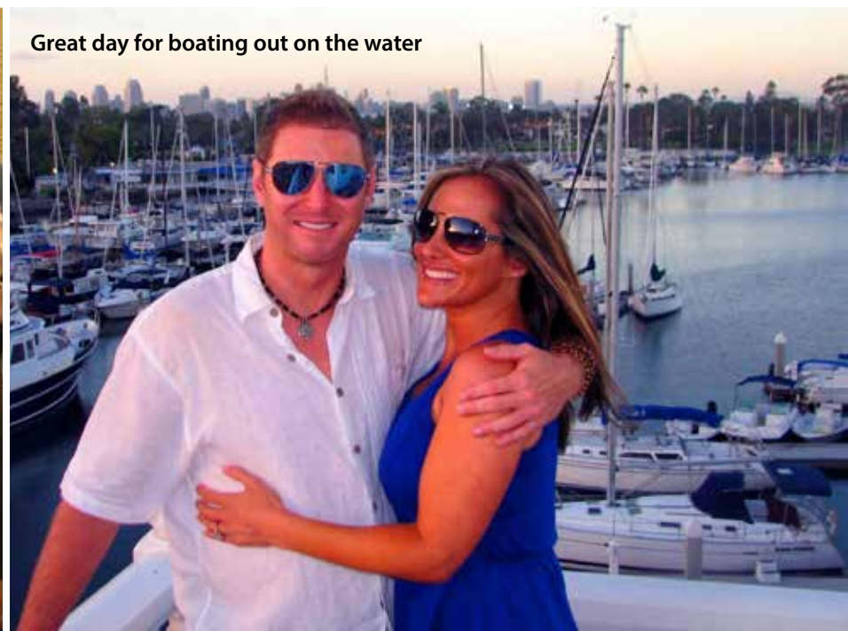
Great day for boating out on the water