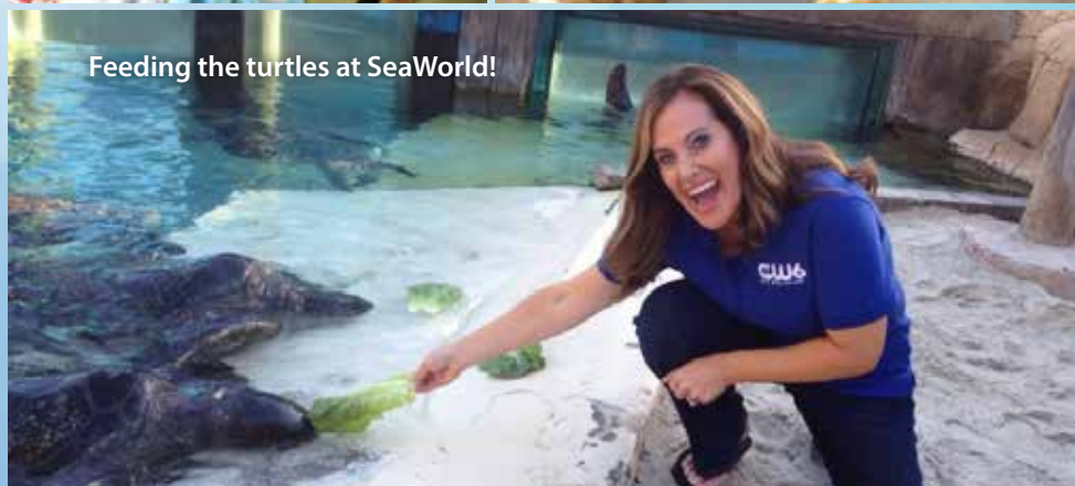
Feeding the turtles at SeaWorld!