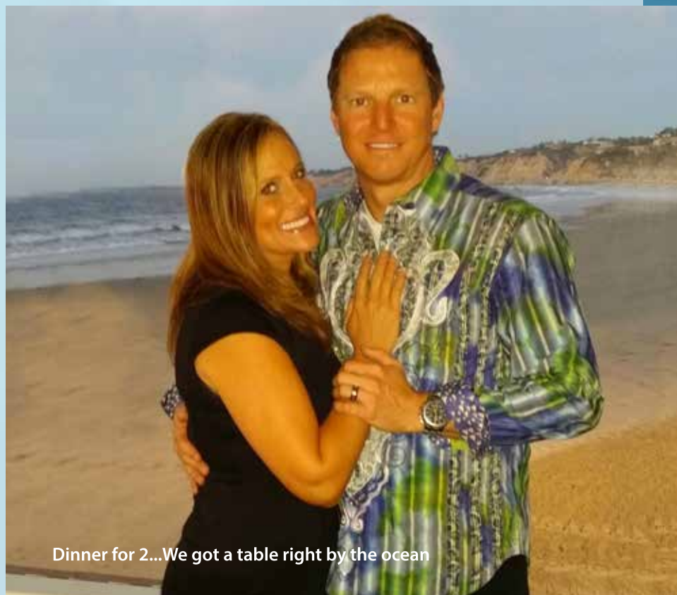
Dinner for 2...We got a table right by the ocean