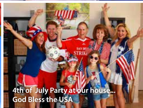
4th of July Party at our house... God Bless the USA