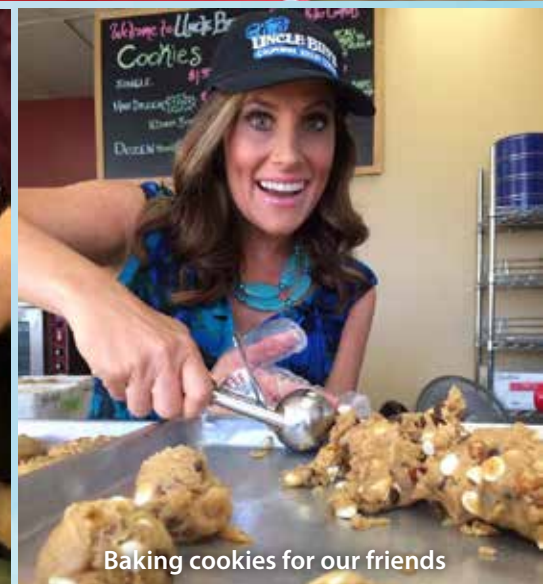
Baking cookies for our friends