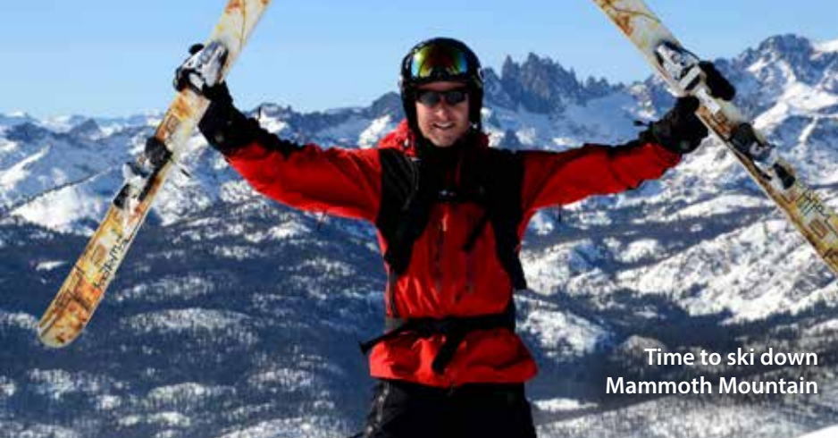
Time to ski down Mammoth Mountain